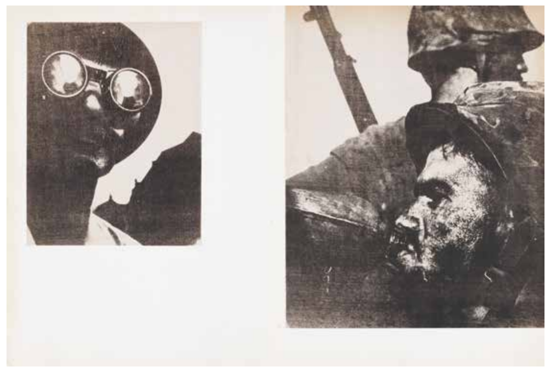
All images are spreads from The Big Book

The book requires an active participation from the viewer: you must interpret, draw connections and be emotionally open. For a man who was so adept at communicating specifics through his descriptive images, and narratives through his humanist series, Smith chose strangely for his opus to take the form of a Molotov cocktail, impassioned and chaotic, as angry as it is bewitched by love, as confused as it is understanding. However unexpectedly, he hits the mark true.